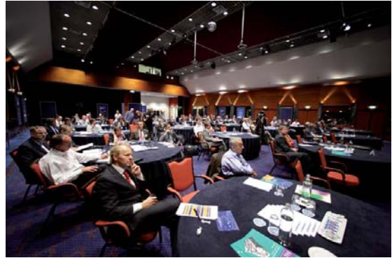
Figure 3: The industry seminar in Amsterdam

PRACE has also undertaken extensive dissemination and outreach activities. A web-presence has been established at www.prace-project.eu . This web site is a central point of public information about all activities within the project. It is complemented by active dissemination channels such as press releases, news-feeds, a quarterly newsletter and contributions to the most relevant HPC conferences. PRACE had booths at ISC 2008 in June in Dresden, at SC08 in Austin, at ICT 2008 in Lyon in November, at ISC 2009 in June in Hamburg, at SC09 in Portland, at ISC 2010 in June